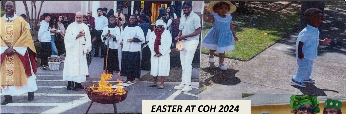
EASTER AT COH 2024

A Warm WELCOME is extended to everyone visiting or here for the first time. If you attend Christ Our Hope on a regular basis and consider this your parish, please register . Registration forms may be found in the vestibule or you may call the office.