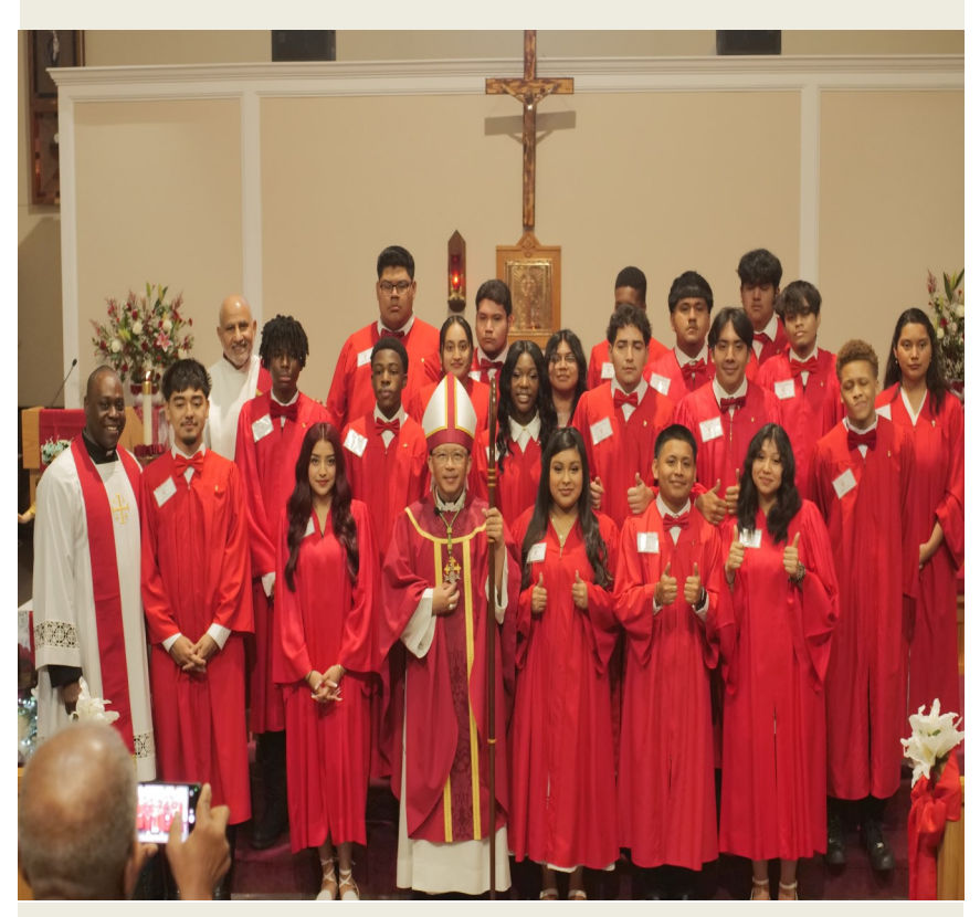
Confirmation Class of 2024